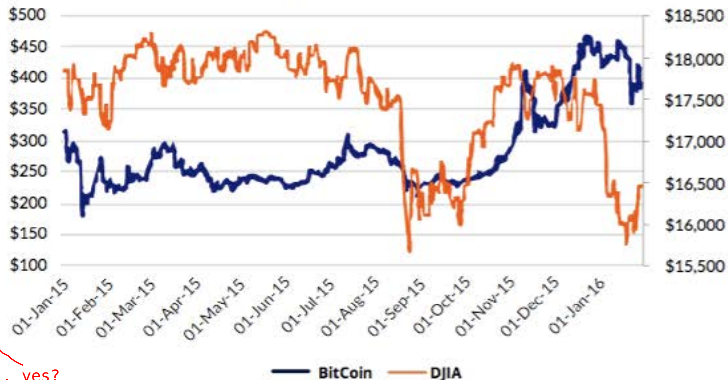
Bitcoin vs. DJIA (Jan 2015- Jan 2016)

12 months! What a great sample! Left scale is $50, Right scale is $500. Scale the right side to $50, and you get a giant spike with BTC, which is far less comparable.